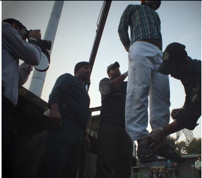
Above a man hanged in Sari Iran in August 2014, appears to have an erection, as does a man hanged in Naishpur in September 2016 (right) who was still struggling at the time.